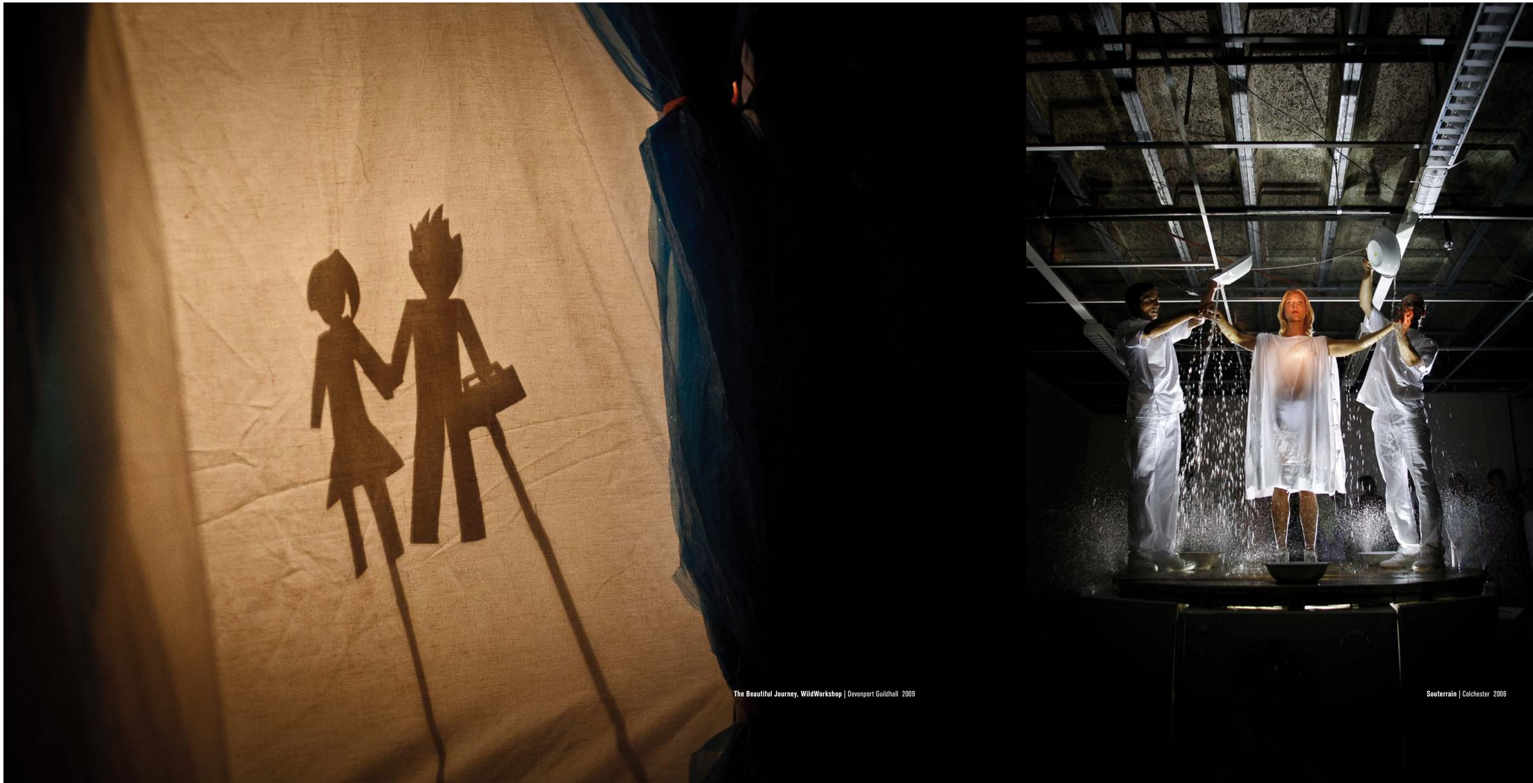
The Beautiful Journey, WildWorkshop | Devonport Guildhall 2009