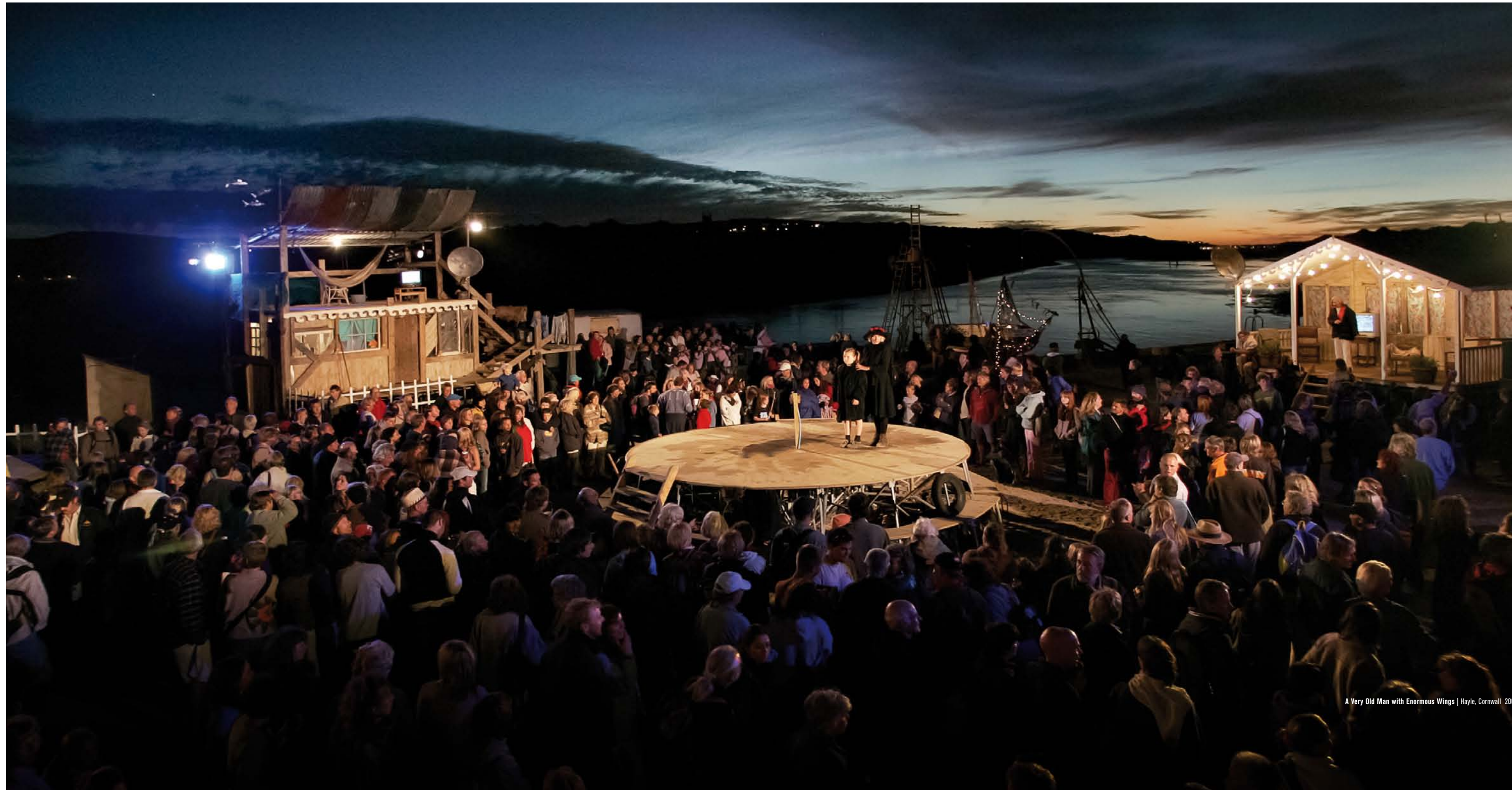
A Very Old Man with Enormous Wings | Hayle, Cornwall 2005